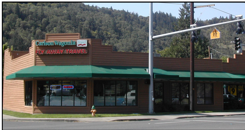
Carlson-Wagonlit Fly Away Travel Paul L. Bentley Architect, AIA PC

The Fly Away Travel facility was built for Brooke Communications and designed to fit a very tight site, with a unique style that pushed for curb appeal. The result was a stair stepped almost old western style building with colorful awnings to break down the scale of the facade to the pedestrian level. Interior spaces provide ample natural daylighting for a great work environment.