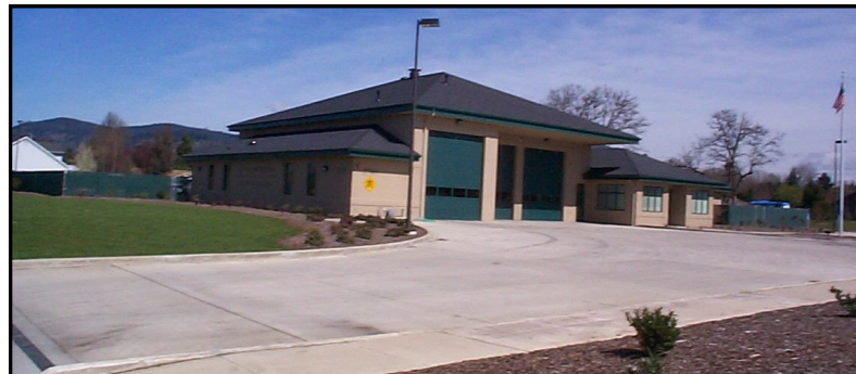
Springfield Fire Station No. 5 Paul L. Bentley Architect, AIA PC

This facility was completed on time and nearly 20% under budget for $1,000,000 and has been the showcase of the Department. Upon its completion and use, the Department hired our firm to provide a study of the other four stations for upgrades to make them similar to station #5.